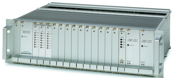
56000 Modular Time & Frequency Distribution System

Model 56000 outputs can include distributed or generated clock signals, frequencies, Network Time Protocol, and IRIG B time code. N.1 clock rate generation from 1Hz to 25MPPS in 1PPS steps is available in addition to N.8 clock rate generation from 8 KPPS to 8.192 MPPS in 8KPPS steps. Also available is a Telecommunications Interface that provides a variety of outputs and alarms common in today's telecommunications applications. The chassis is configured with front and rear plug-in cards. The front panel plug-in circuit cards perform the modular rate generation and distribution functions and are hot swappable. The rear panel interfaces are also implemented using plug-in cards with a wide variety of connector types and styles. Of the 21 card